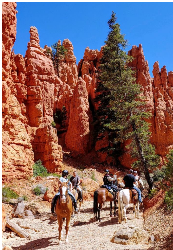
AMA competitors enjoying a trail ride after the competition in beautiful Bryce Canyon, UT.

We would like to thank all those who attended and volunteered to help make our 3 rd competition a success. We are already planning our 2020 event and are looking at venues around the Park City area.