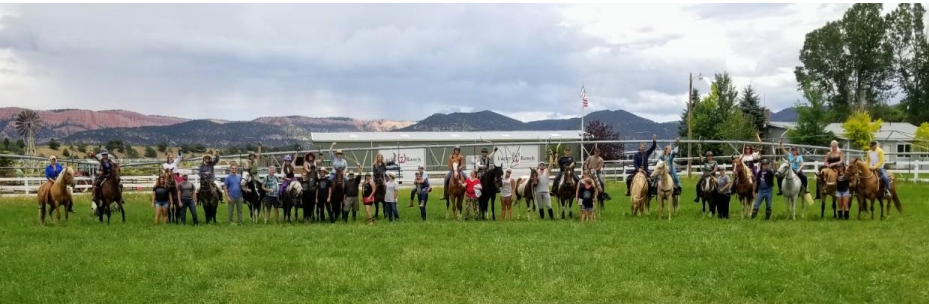
Competitors at Alpine Mounted Archery's 3 rd Annual Competition, Hatch, UT.